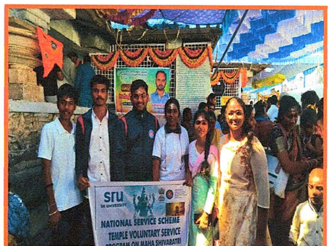
Caption: Service to humanity is service to God – NSS volunteers offering their selfless service at the temple.